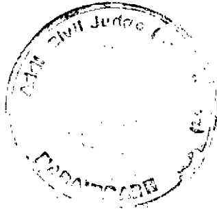
Additional Civil Judge (Senior Division) Naraingarh

Given under my hand and the seal of the Court, this 04-12-2020 .