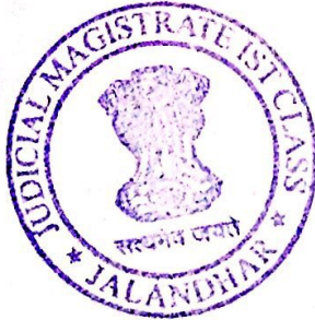
Judicial Magistrate First Class Jalandhar

Take notice that, in default of his/their appearance on the day before mentioned, the above said case will be heard and determined in his/their absence according to law.